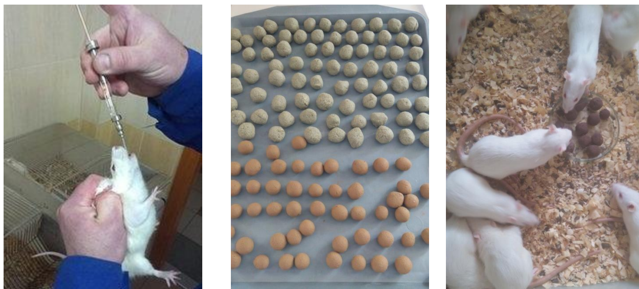
Fig. 1. Rat. Toxin introduction in II, III, IV – groups. Preparation and Feeding of Feed Additives HammecoTox and Zeolite

During the experiment, observations were made of the behavior of animals, their clinical condition and death were shown. At the 14th and 21st day of the experiment rat were weighing and blood was collected for hematological, immunological and biochemical studies, by decapitation, under a slight, etheric anesthetic, following the position of the European Convention for the Protection of Vertebrate Animals, which are used in experiments and other scientific purposes (Strasbourg, 1986).