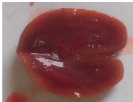
The kidneys are hyperemic, the border between the cortical and the brain is erased