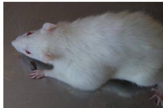
Fig. 3. Manifestations of toxicosis in rats, edema in joints in animals of II, III, IV groups