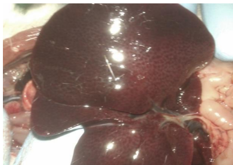
Liver, multiple point hemorrhages

The concentration of creatinine and urea in animals of the second group exceeded the physiological values, which was a clinical sign of the development of inflammatory process in the body of rats against the background of toxicosis. The biochemical picture of blood serum was confirmed by pathological and anatomical changes, in particular, on the autopsy it is visible that the kidneys are of dark cherry color, the border between the cortical and brain zone is erased. All changes in the kidneys indicate a violation of the function of filtration and absorption, as well as from the side of the liver, which was dark cherry color with multiple hemorrhages, and inflammatory points (Fig. 5).