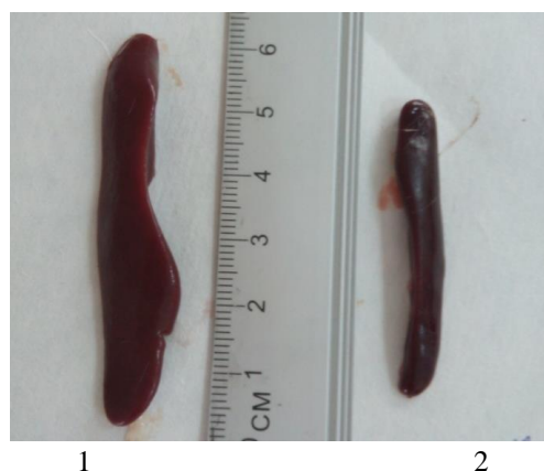
Fig. 4. Spleen of animals of group II for fumonisin toxicosis. 2. Spleen of animals of group IV for use of Zeolite (Z)

Note: hereafter: * – P \leq 0.05 ; ** – P \leq 0.01 in comparison with control